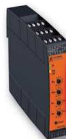
Softstarter UG 9019